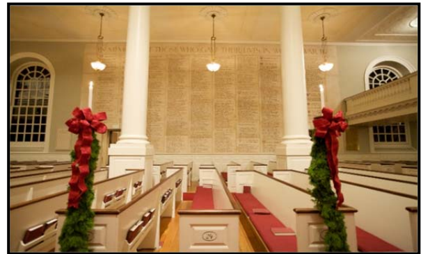
Memorial Church in the Harvard Yard

Memorial Church was dedicated in 1932 to initially honor Harvard alumni killed in the war to end all wars (i.e. World War I). However, subsequent conflicts waged up to and including the Vietnam War have necessitated the addition of more names on the walls of the Church which now totals 1,352 Harvard patriots who made the supreme sacrifice in the following conflicts: 376 from World War I (note: including 4 in the German Army and 3 from Radcliffe College), 697 from World War II, 18 during the Korean War and 22 from the Vietnam War. However, there are no memorials for the 62 Harvard alumni who died for their country which happened to be the Confederacy, the 22 Harvard casualties in the Continental militia, Army or Navy in the American Revolution nor their Harvard Tory enemies.