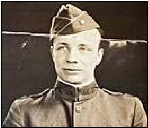
Lt. Col. Ted Roosevelt Jr. in France -1918

Theodore Roosevelt Jr. (H-1909) was the oldest son of President Theodore Roosevelt. After Harvard, he worked in the steel and textile industries before becoming a successful investment banker. With the war clouds on the horizon, he trained in Plattsburg, NY and was commissioned an Army captain in August 1917 and sailed for France in April 1918 with the 26 th Regiment of the 1 st Infantry Division. He fought in numerous campaigns including: Cantigny, the Marne, Noyon-Montdidier defensive, the Meuse-Argonne offensive and at Soissons where he was wounded and gassed in May 1918. By the summer of 1918, Ted had been promoted to lieutenant colonel and appointed as a battalion commander. After too many damp days in water-logged trenches, Ted developed severe arthritis, which would plague him for the rest of his life. For his bravery and leadership, Ted was also awarded the Legion d'Honneur and the Croix de Guerre. Translated from French, the citation for his awards reads: Major Theodore Roosevelt Jr. Commanding Officer of the 1 st Battalion, 26 th American infantry regiment reflects the energy and enthusiasm of his battalion. Despite a poison gas attack, he remained at this post and successfully directed the resistance against a German counter attack. In a moment's notice on 29 June 1918, he organized a raid against the enemy position which he executed under sustained close enemy fire"