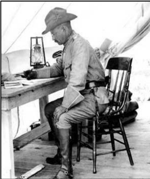
President Teddy Roosevelt in Cuba

Among the 18 Medal of Honor recipients from Harvard are 5 lawyers, 4 businessmen, 3 career military officers, 2 medical doctors, 2 politicians and 2 in their 20's who were killed in action. This pantheon of Harvard heroes includes 8 Army generals, a flag officer from the USMC, Navy & USAF, 4 field grade Army officers, a Marine 2 nd Lt. and an Army staff sergeant. Harvard warriors who were awarded the Medal of Honor fought in every major US conflict since the Civil War and included the only other father & son recipients besides General Douglas MacArthur and his father who were West Point graduates. 8 of the Harvard recipients were in the Union Army during the Civil War. 2 Harvard recipients served near the end of the 19 th century (i.e. General Leonard Wood USA (HMS- 1884) from the Indian Wars & President Teddy Roosevelt (H-1880) who was colonel in the US Volunteers and commanding officer of the Rough Riders in Cuba during the Spanish American War).