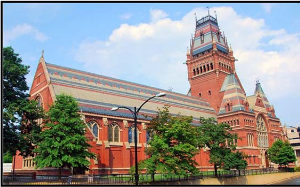
Memorial Hall at Harvard

There are at least 37 memorials at Harvard for alumni who died for our country while on active military service. The 2 most prominent & widely known sites honoring veterans are Memorial Hall and nearby Memorial Church located in the heart of Harvard Yard. Memorial Hall was completed in 1877 to commemorate the 117 casualties from Harvard who fought in the Union Army during the Civil War.