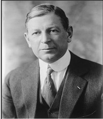
Col. Dwight Davis USA

The Legion d'Honneur was established by Napoleon and is the highest award in France for both military and civil service to France. A military based induction into the Order of the Legion d'Honneur is almost equivalent to the Victoria Cross (UK) and the Medal of Honor (US). During World War I, at least 18 Harvard graduates received the Legion d'Honneur from the French government of whom 14 also were simultaneously awarded the Distinguished Service Cross or the Navy Cross and 3 others also were recipients of the Silver Star. Among the more notable in this group were: the namesake of the Davis Cup, the founder of the Lafayette Escadrille in France, a son of a president of the United States and the American "Ace of Aces".